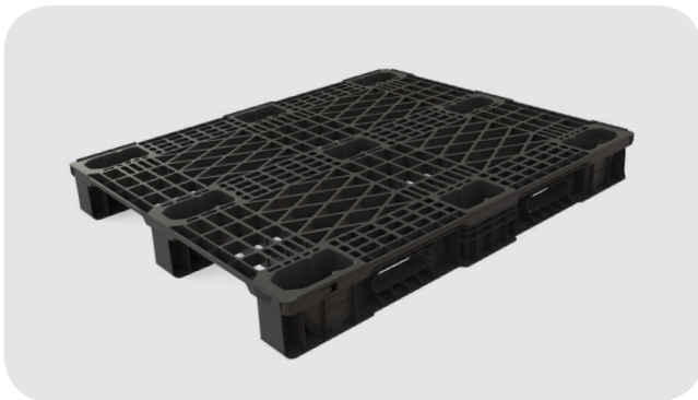
Open deck (optional)