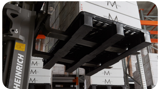
Smooth bottom surface